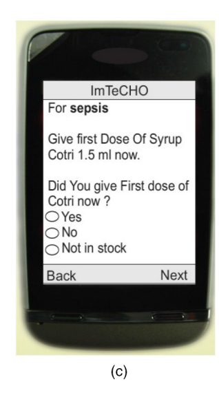
Fig. 1. Selected screen shots of the ImTeCHO application (a) main menu, (b) ASHAs' Daily Schedule, (c) diagnosis with management guidelines.

measures were put in place, including encryption of data along with use of username and password. The database server and web application were installed on a Tier-1 highsecurity data center. The application has full Unicode Transformation Format compatibility and can support any Indian language. The content of the application (text, videos, etc.) can be modified from the web interface. Its open source code makes it possible to adapt it in future, as required.